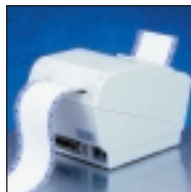
External Paper Feed Path