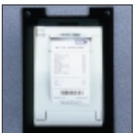
Wall Mount Option