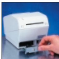
High Speed USB Interface (user installable option)