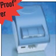
For Hospitality Applications in Bars and Restaurants