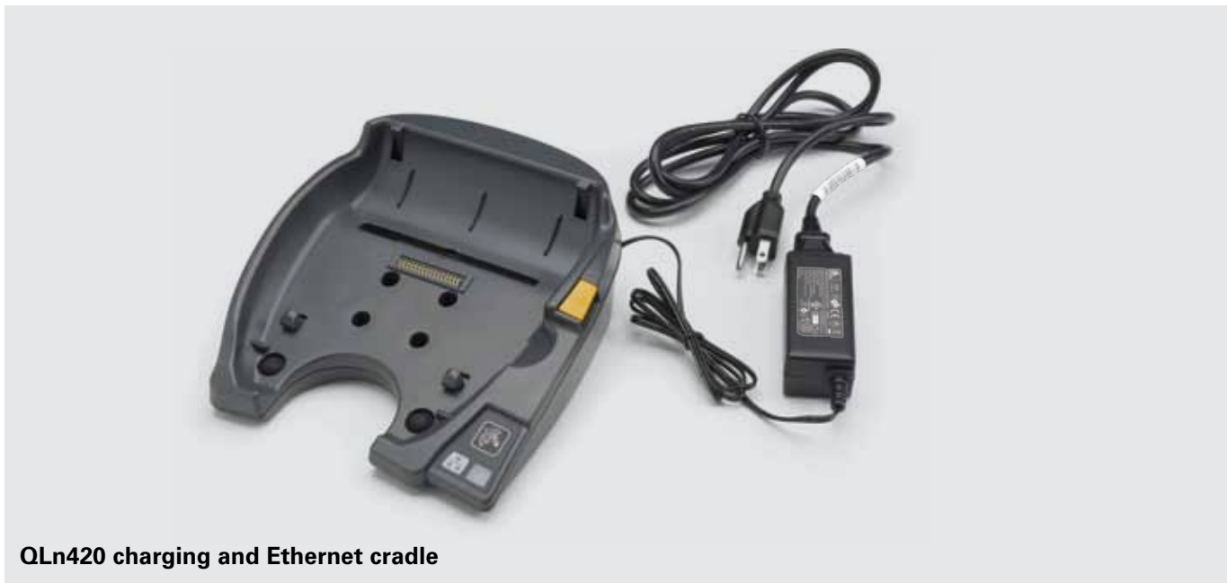
QLn420 charging and Ethernet cradle