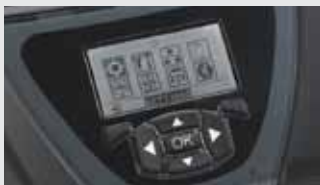
Easy-to-read display with larger, higher-resolution screen