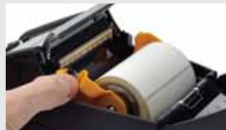
Intuitive peeler operation